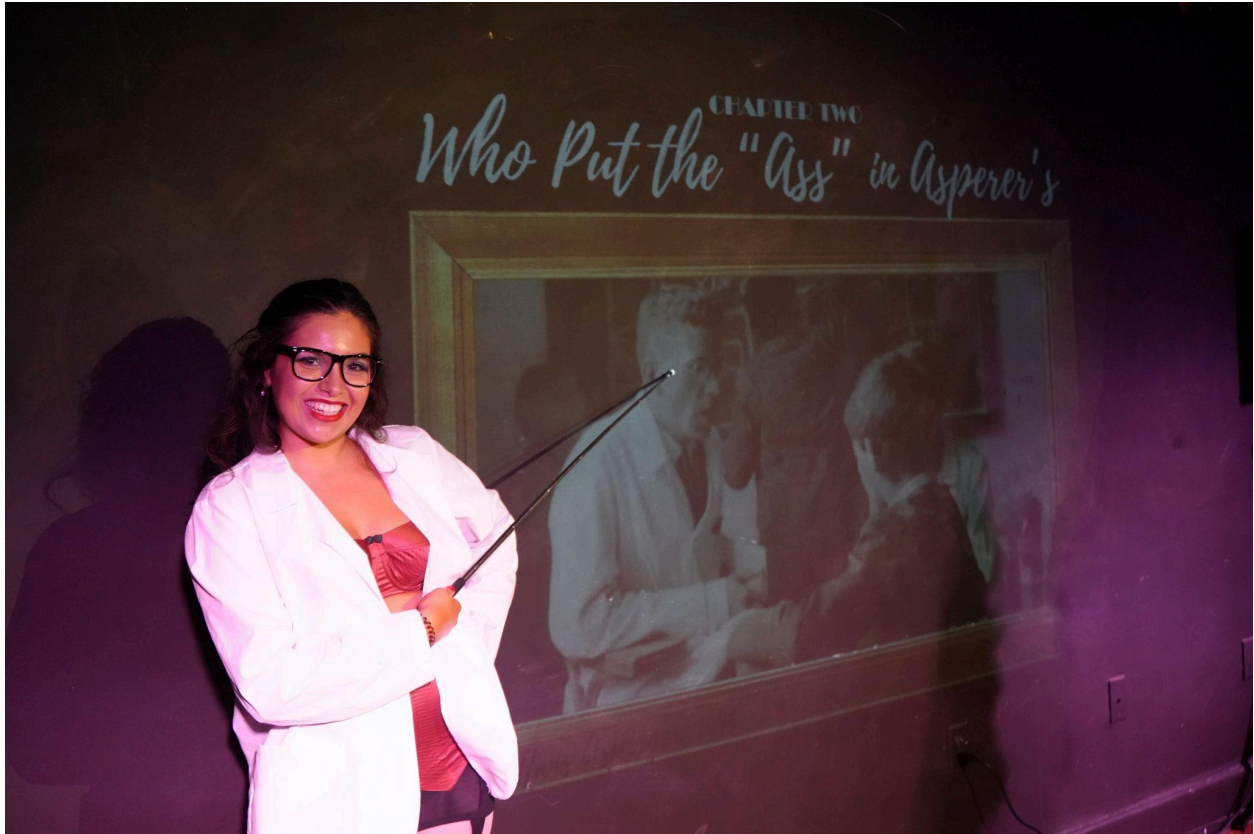
White lab coat over said lingerie with glasses.