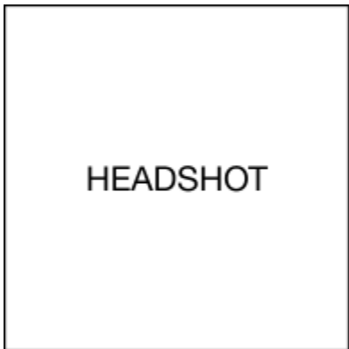
TBD plays the role of Understudy TO BE CONFIRMED.