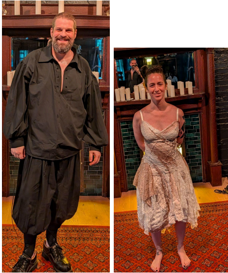
Ben and Stitch Possessive Lovers