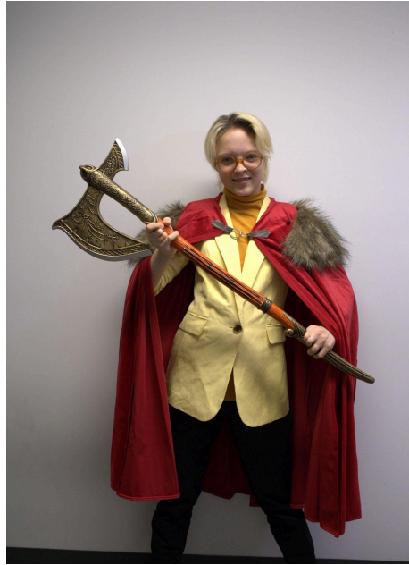
Chike the Fearless (DnD world)