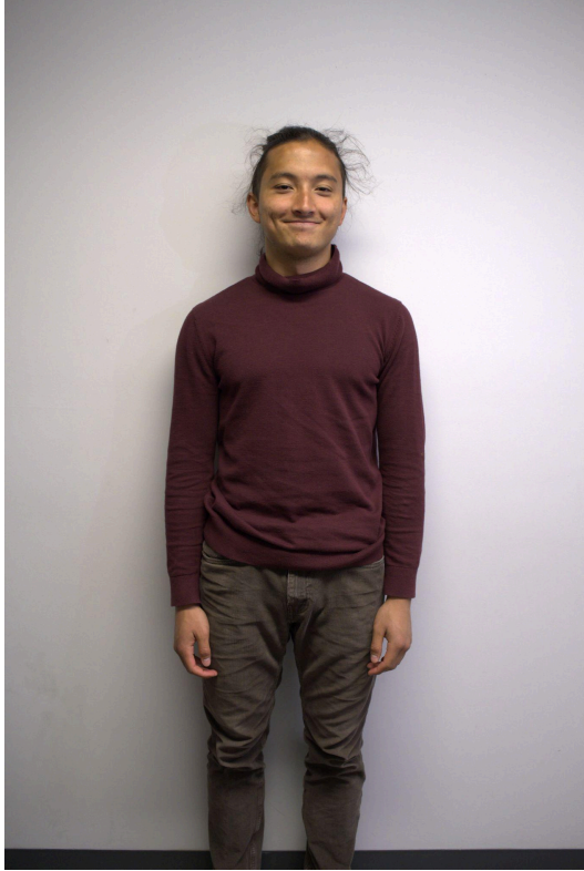
Nico (Real world)