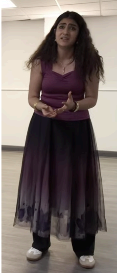
The Princess (DnD World) Tara (Real World)