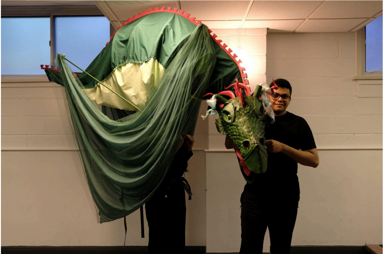
Brego the Dragon