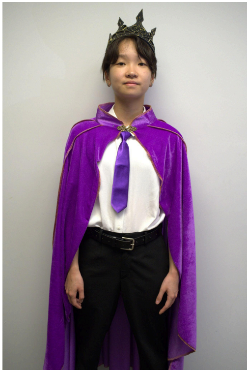
The King (DnD World)