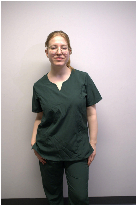
Sage (Real world)