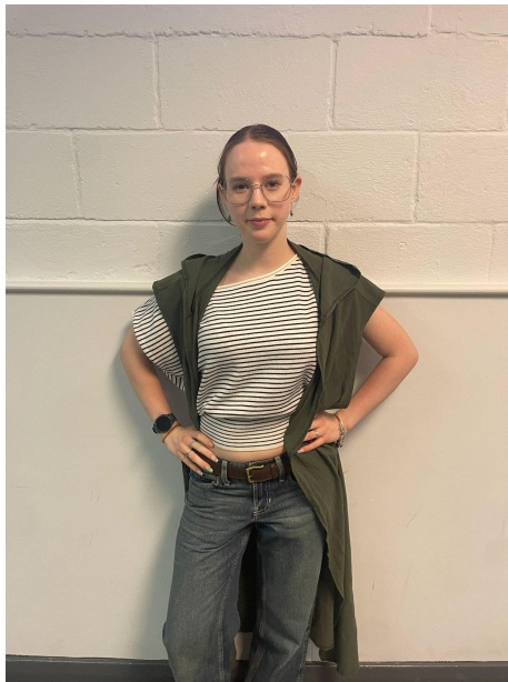
Elanor Oakfate (DnD world)