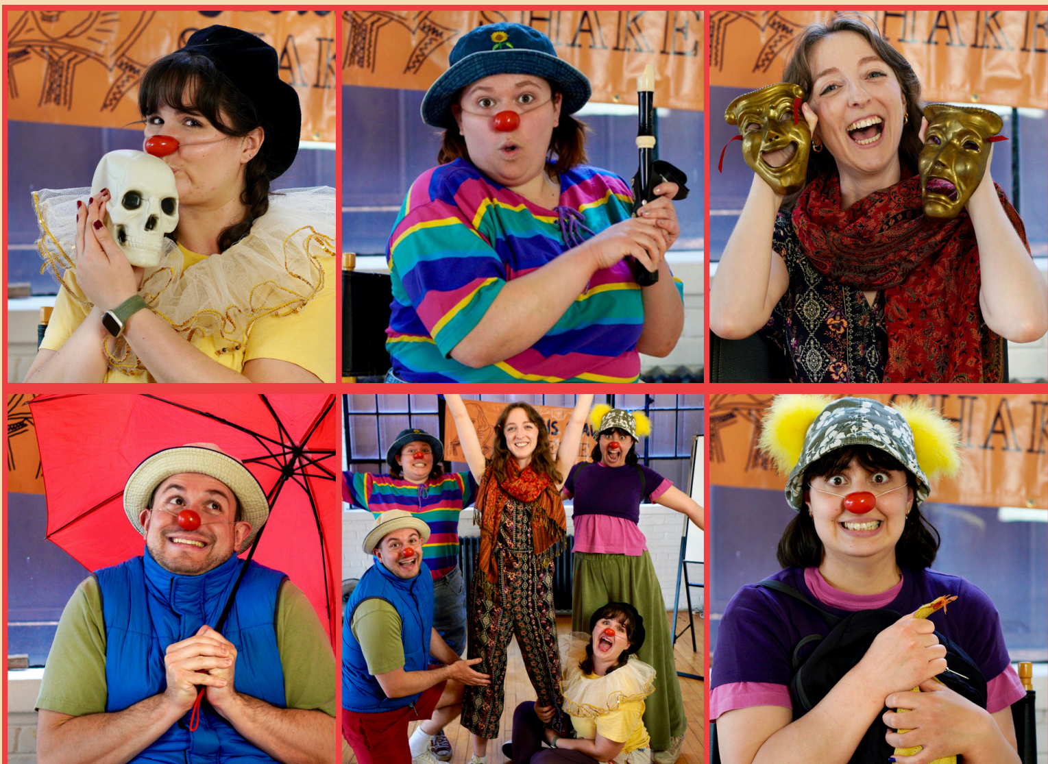
Clowns photos by Full Haus Productions

Want to support Panoply's work? Visit www.panoplycollective.com to donate, sign up for our mailing list, & find out about upcoming projects!